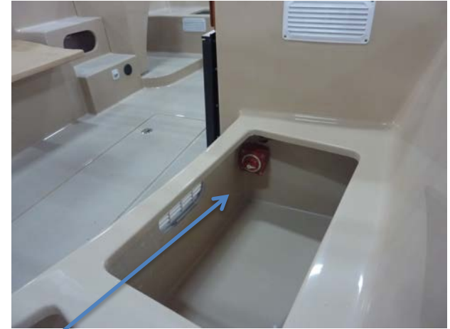
All Other Duffy Models (Under Port Seat)

Turn ON the main battery switch. You only need this switch when transporting. Turning it to the OFF position will not allow the batteries to charge.