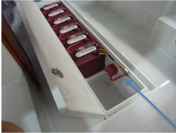
Duffy 16 Back Bay

Turn ON the main battery switch. You only need this switch when transporting. Turning it to the OFF position will not allow the batteries to charge.